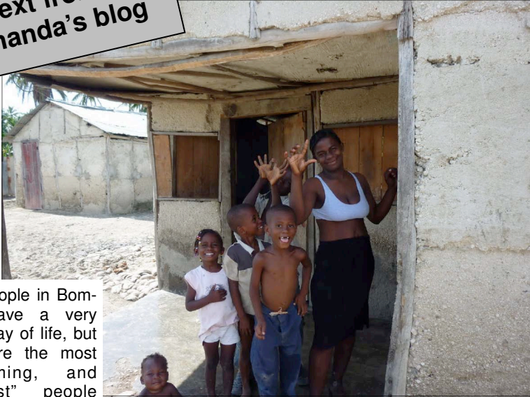
The people in Bombita have a very hard way of life, but they are the most welcoming, and "smiliest" people you could meet.

Take a look at day to day news from COPA in La Hoya and Bombita http://copa365.blogspot.com