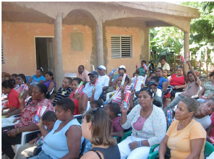
Pictured above, the community of Los Cocos in someone's front patio with everyone holding up their free toothpaste and toothbrush donated by Ege Haina.

What impressed me about these communities is that they were hungry for this information, paid attention, participated and actually expressed what they didn't know and what they had learned to change at home.'